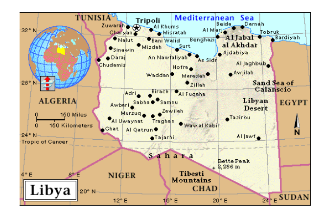
Figure 2 : Libyan geographical map.

Figure 2, and it is a part of the northern hemisphere with 25^{\circ} N and 17^{\circ} E latitude and longitude affected by dust and some storms.