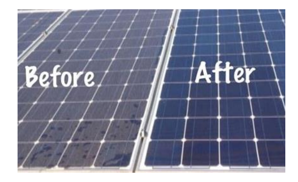
Figure 4: Comparison of dust impacts on solar panels.

In areas with high levels of dust or pollution, the impact can be even greater [25]. Therefore, it is important to regularly clean the solar PV panels to prevent dust buildup. Regular cleaning can help maintain optimal performance and increase the lifespan of the solar panels [26]. Additionally, it is important to choose a location for solar panels that is less prone to dust accumulation. In terms of gaining a sustainable environment, solar power is a great alternative to traditional sources of energy that rely on fossil fuels [27]. By reducing our reliance on fossil fuels and using clean, renewable energy sources like solar power, we can work towards a more sustainable future with less pollution and a healthier planet [28].